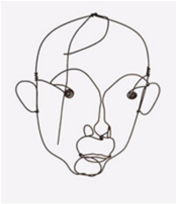
The appearance of line in a three-dimensional form: a wire sculpture (Alexander Calder, Joan Miró , c. 1930. )