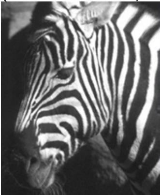
Line is not just an artificial tool of the artist.