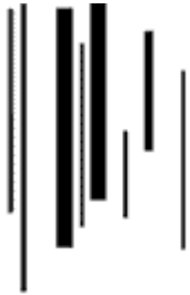
Vertical lines of varying lengths and weights.